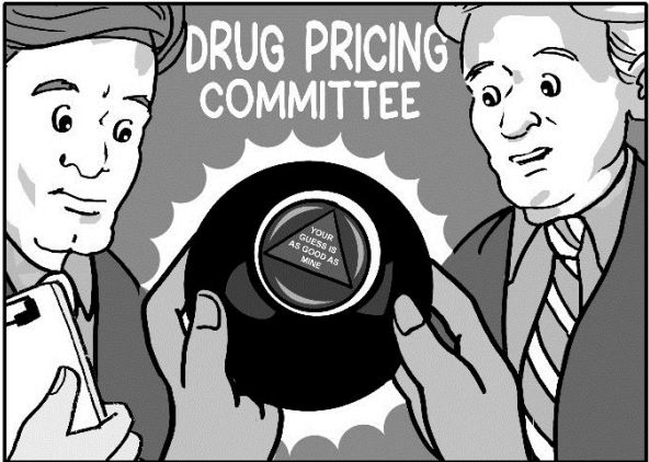
"...YOUR GUESS IS AS GOOD AS MINE."