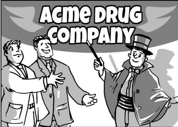
"J.B., HAVE YOU MET BOB FROM ACCOUNTING?"