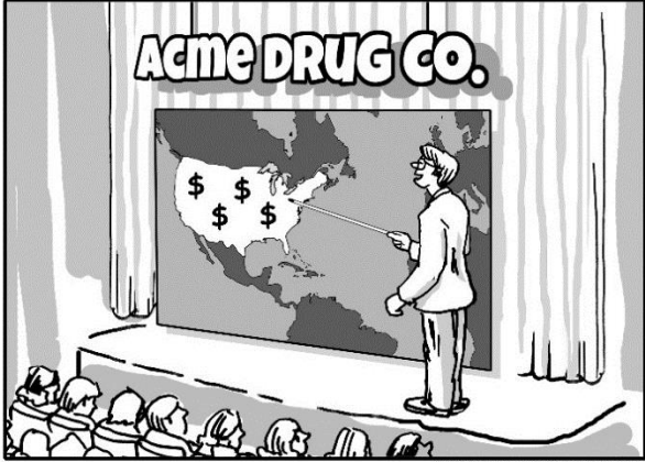
"SO WHEN IT COMES TO PRICING JUST REMEMBER OUR COMPANY'S THREE STRICT GUIDELINES - LOCATION, LOCATION, LOCATION."